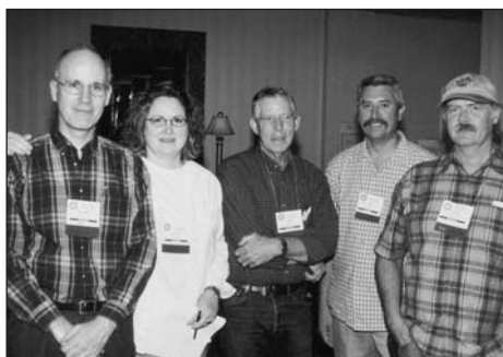
Audio Visual Team