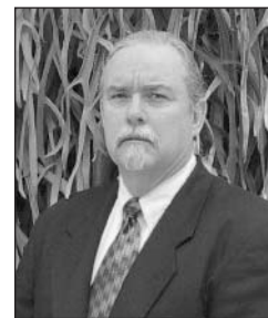
By Ron Schroader

Swimming pool, spa and hot tub drain hazards have plagued the swimming pool and spa industry for over three decades. For just as many years, pool industry leaders have pondered the causes and solutions for this problem.