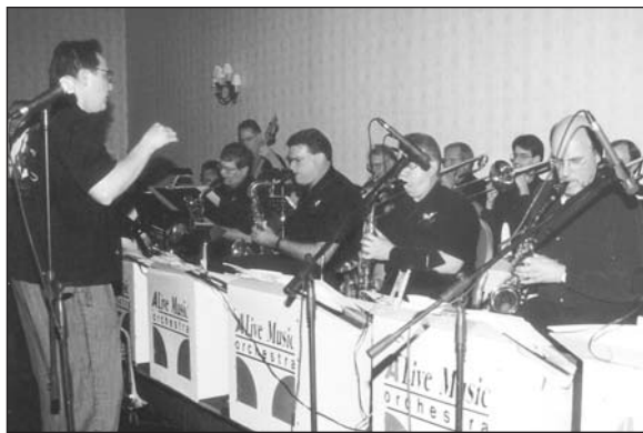
Alive Music Orchestra

and Superior, and CEHA Corporate Members Same Day Distributing, Bord Na Mona, and the Chartered Institute of Environmental Health Northwestern Center. The annual dinner banquet and dance,