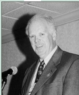
Frank O' Sullivan Vince Durham Memorial Award