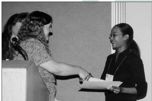
Jeanette Watson Martin Smilo Undergraduate Scholarship Award

Each year, CEHA takes the opportunity to acknowledge outstanding achievements in the field of Environmental Health by giving recognition and / or monetary assistance to deserving professionals and students.