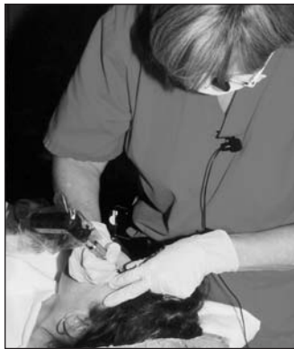
Body Art Demo