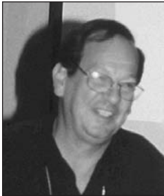
By Dennis Kalson

F acing steadily increasing levels of infectious disease, the Minister of Health in Honduras decided in 1995 to completely reform the public health system. In his search for strategic direction in designing the