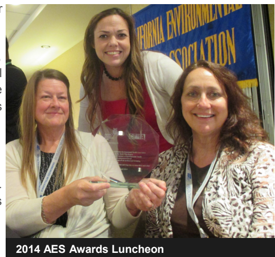
2014 AES Awards Luncheon

We offer discounts for car rental discount through Enterprise rental car. Just add CEHA for a discount on your next car rental. We offer discounts for Pet Insurance. Visit our website for more details.