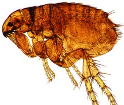
Cat Flea, Ctenocephalides felis

The Orange County Vector Control District (OCVCD) is tasked with preventing cases of vector-borne disease. In 2006, after a 15-year absence of human cases, flea-borne typhus returned to Orange County, California.