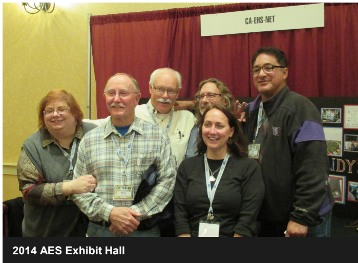
2014 AES Exhibit Hall

CEHA informs its members of new and emerging regulatory issues that may affect the way the environmental health profession operates. This may be in the form of written articles, workshops and seminars or local chapter meetings.