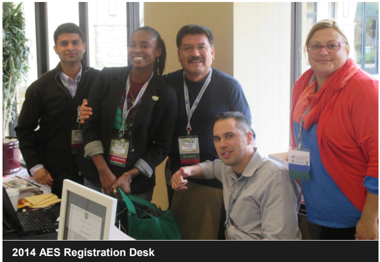
2014 AES Registration Desk